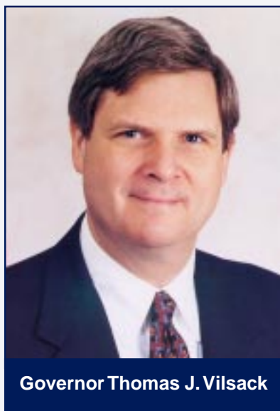
Governor Thomas J. Vilsack

Iowans have shown many times they have the resiliency and resourcefulness to deal with crises. I'm confident that in the same spirit with which we've helped each other cope with past disasters, we will successfully deal with any cards nature or humans might deal us.