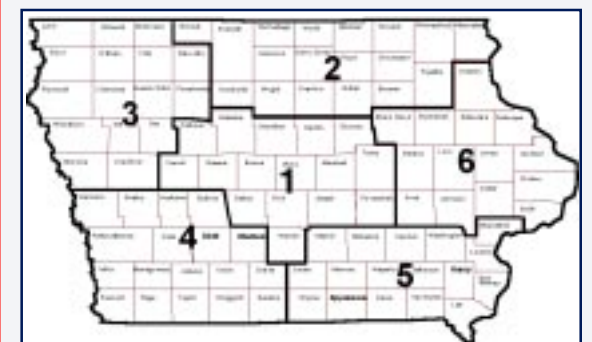
Iowa's six smallpox planning regions