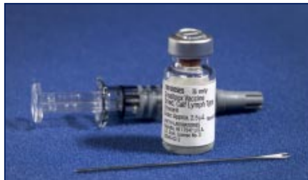
Components of a smallpox vaccination kit including the diluent, a vial of Dryvax® smallpox vaccine, and a bifurcated needle.

The smallpox vaccine is not given with a shot as most people have experienced. It is given using a bifurcated (two-pronged) needle that is used to prick the skin a number of times in the upper arm.