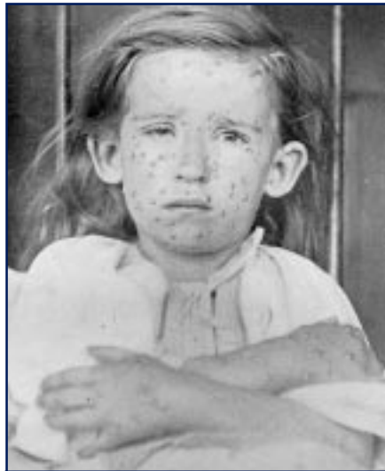
1901: an Iowan with smallpox

pox appeared in a community, the board believed that every person had to get the vaccination, and if employed, the vaccination was a condition to continue employment. Also, all children had to present a certificate of successful vaccination before entering school.