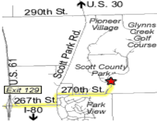
Map of Scott County Park

Map to Scott County Park Exit #129 from U.S. 61 East on 267th Street North on Scott Park Road East on 270th Street Entrance on Left.